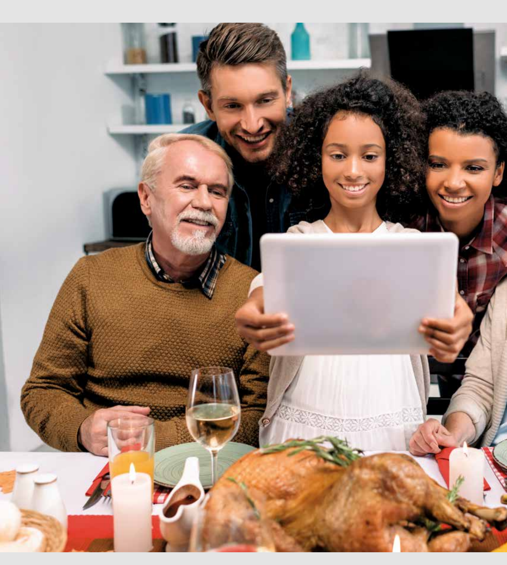
2 - Minden Gross LLP - Spring 2021